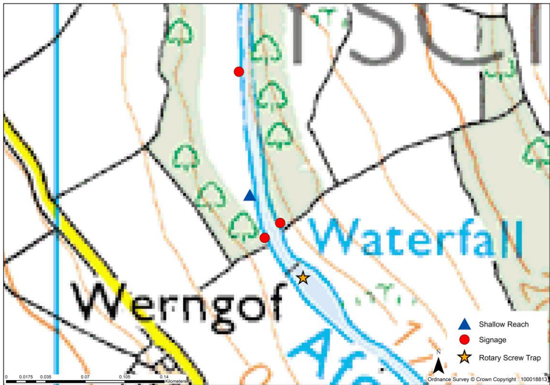
Fig 2: Rotary Screw Trap: Afon Ysgir, near Aberyscir