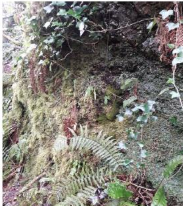
limestone outcrop with frequent Distichium capillaceu , could easily be damaged by passing