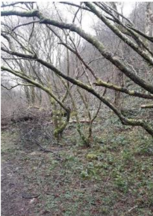
Constraint 1: Hazel by the path supporting Peltigera horizontalis