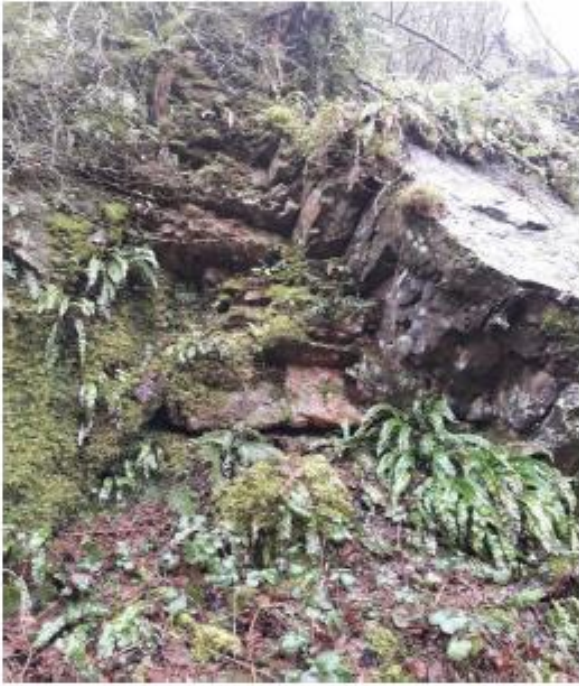
limestone outcrop set back from path, with occasional Distichium capillaceum