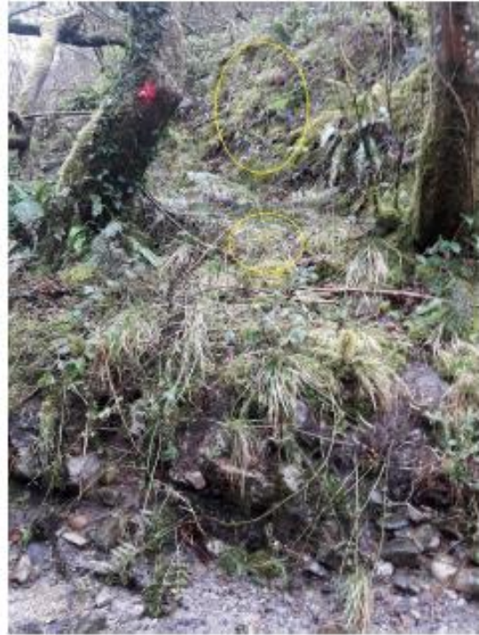
6 & 7: patches of Rhytidiadelphus subpinnatus on steep banks at SN91530817 to SN91530818.