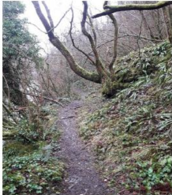
Constraint 2: Ash on limestone outcrop with Leptogium lichenoides