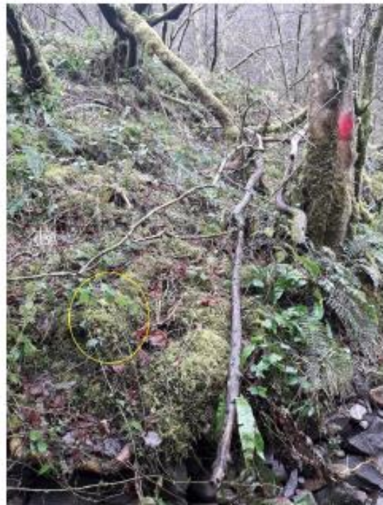
6 & 7: patches of Rhytidiadelphus subpinnatus on steep banks at SN91530817 to SN91530818.