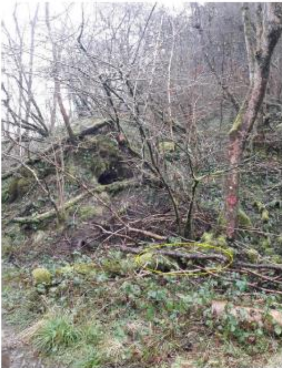
fallen tree trunk supporting Rhytidiadelphus subpinnatus , just before a limestone outcrop